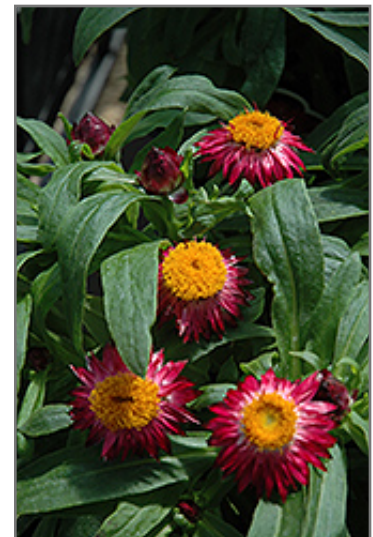
Mohave Dark Red Strawflower flowers