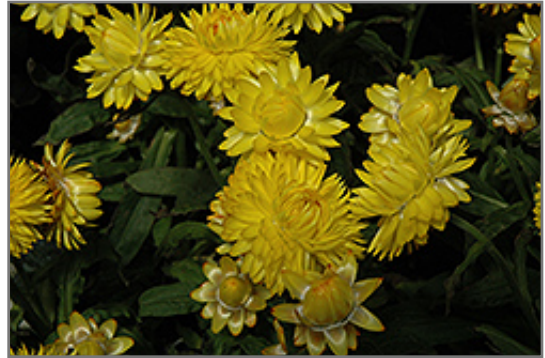
Strawburst Yellow Strawflower flowers