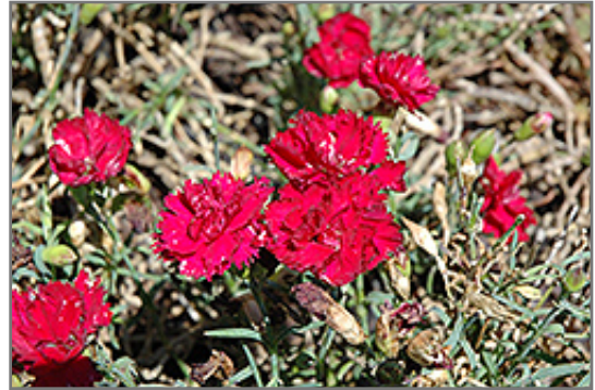
Garden Spice Red Carnation flowers