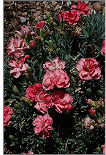
Sunflor Luxor Carnation flowers

Fully double deep red miniature carnations with fringed petal edges bloom consistently over a long season, especially in warmer climates; great for border fronts, containers, and floral arrangements