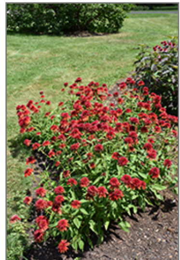
Double Scoop Orangeberry Coneflower in bloom