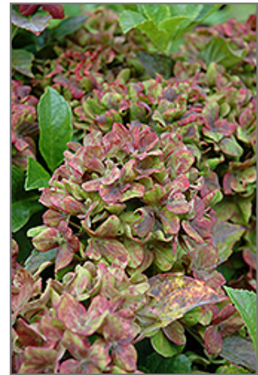
Pistachio Hydrangea flowers