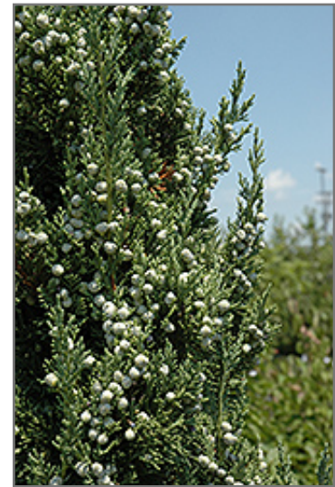
Trautman Juniper fruit