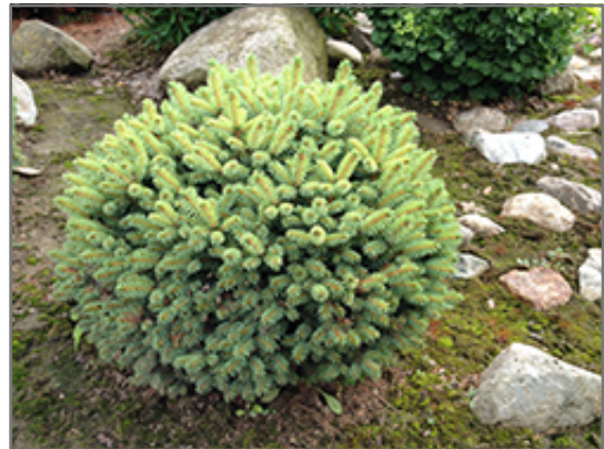
Roundabout Blue Spruce