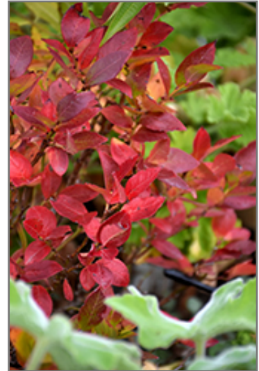
Jelly Bean Blueberry in fall

Jelly Bean Blueberry features dainty clusters of white bell-shaped flowers with shell pink overtones hanging below the branches in mid spring. It has red-variegated green foliage. The glossy oval leaves turn an outstanding red in the fall. It features an abundance of magnificent blue berries in mid summer.