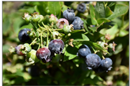
Jelly Bean Blueberry fruit