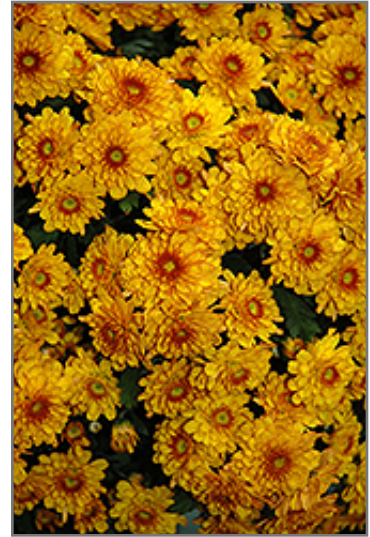
Sunbeam Bronze Bicolor Chrysanthemum flowers