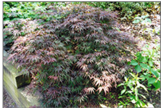
Cutleaf Japanese Maple