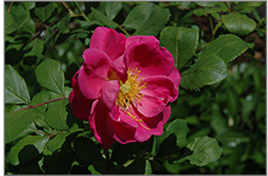
Basye's Blueberry Rose flowers