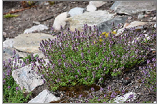
Lemon Thyme in bloom