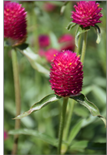
Qis Carmine Gomphrena flowers

Qis Carmine Gomphrena is recommended for the following landscape applications;