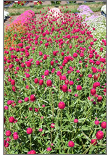
Qis Carmine Gomphrena in bloom

* This is a 'special order' plant - contact store for details