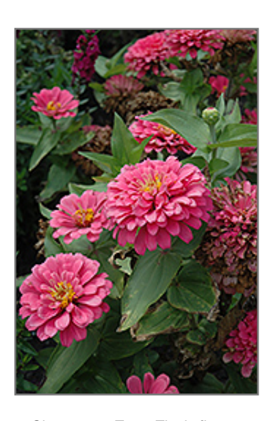
Champagne Toast Zinnia flowers

Champagne Toast Zinnia will grow to be about 16 inches tall at maturity, with a spread of 12 inches. When grown in masses or used as a bedding plant, individual plants should be spaced approximately 8 inches apart. Its foliage tends to remain dense right to the ground, not requiring facer plants in front. This fast-growing annual will normally live for one full growing season, needing replacement the following year.