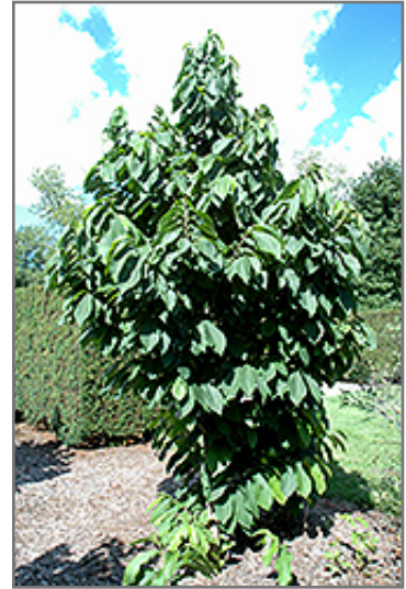
Taytoo Paw Paw

Taytoo Paw Paw features unusual lightly-scented nodding dark red flowers from mid to late spring. It has dark green deciduous foliage. The large oval leaves turn an outstanding red in the fall. It features an abundance of magnificent green berries from mid to late summer. The fruit can be messy if allowed to drop on the lawn or walkways, and may require occasional clean-up.