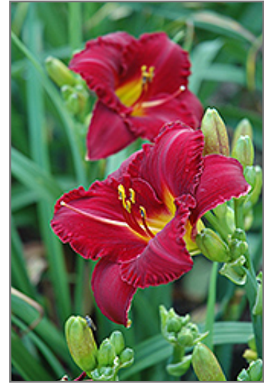
Pygmy Prince Daylily flowers