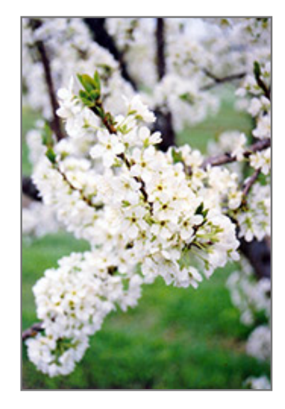
Vanier Plum flowers

* This is a 'special order' plant - contact store for details