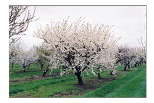
Vanier Plum in bloom