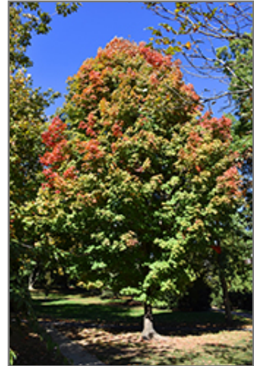
Endowment Sugar Maple