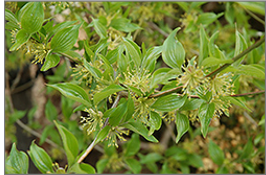
Lemon Zest Japanese Cornelian Dogwood flowers

Lemon Zest Japanese Cornelian Dogwood is recommended for the following landscape applications;