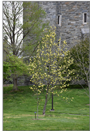
Green Bee Magnolia in bloom