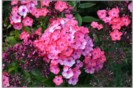
Garden Girls Glamour Girl Garden Phlox flowers

Garden Girls Glamour Girl Garden Phlox is recommended for the following landscape applications;