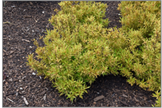
Colorstar Flamingo Pink Weigela

This shrub should only be grown in full sunlight. It prefers to grow in average to moist conditions, and shouldn't be allowed to dry out. It is not particular as to soil type or pH. It is highly tolerant of urban pollution and will even thrive in inner city environments. This is a selected variety of a species not originally from North America.