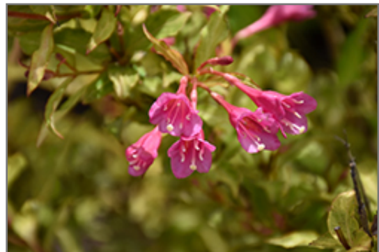
Colorstar Flamingo Pink Weigela flowers