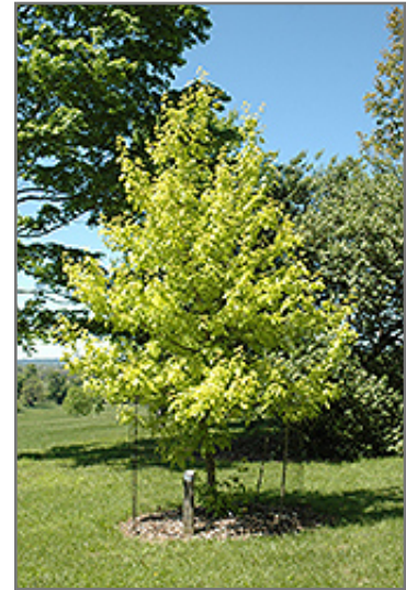
Kelly's Gold Boxelder