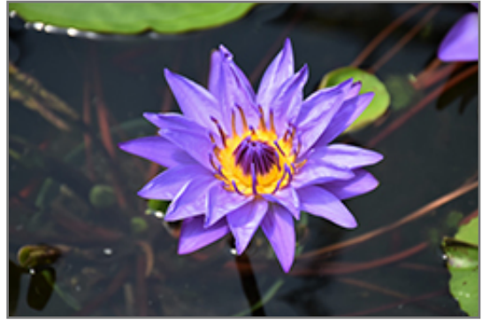
Director George T. Moore Tropical Water Lily flowers

Director George T. Moore Tropical Water Lily is recommended for the following landscape applications;