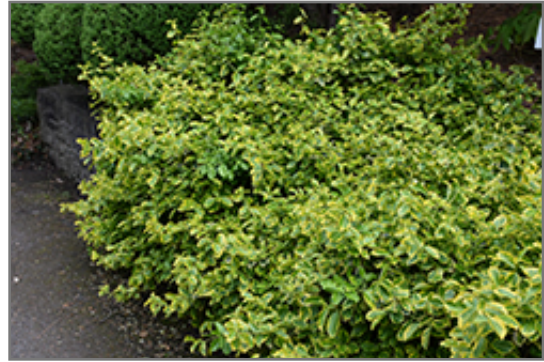
E.T. Gold Wintercreeper

E.T. Gold Wintercreeper is recommended for the following landscape applications;