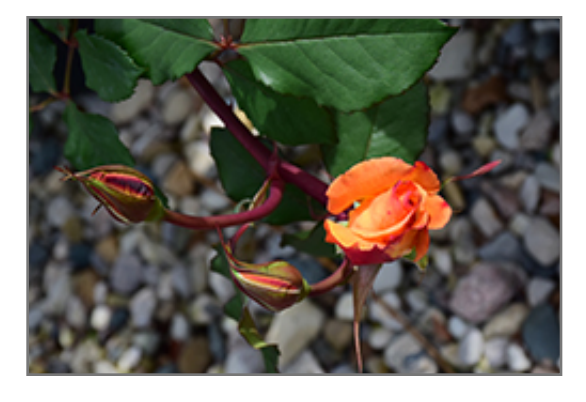
Chris Evert Rose flower buds