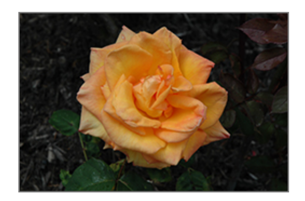
Chris Evert Rose flowers

361 N. Hunter Highway Drums, PA 18222 (570) 788-4181 www.beechwood-gardens.com