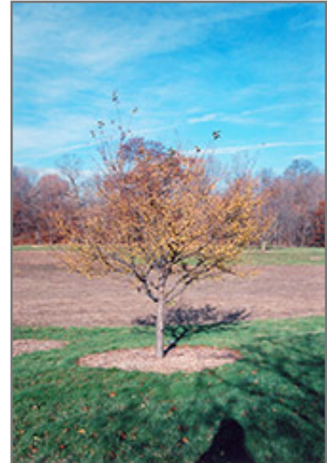
Winter Gold Flowering Crab fruit

Winter Gold Flowering Crab is recommended for the following landscape applications;