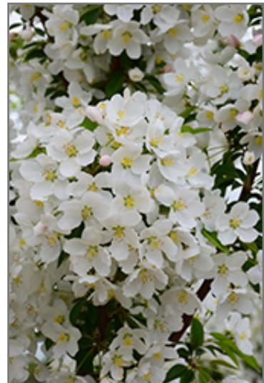
Adirondack Flowering Crab flowers