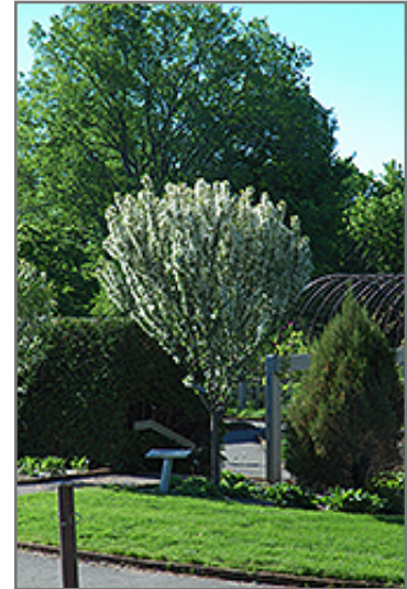
Adirondack Flowering Crab in bloom