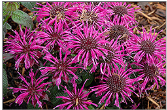
Balmy Purple Beebalm flowers (faded)