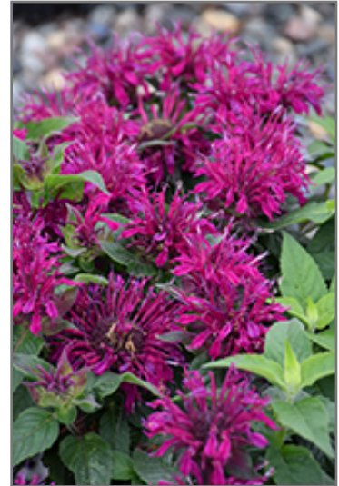
Balmy Purple Beebalm flowers