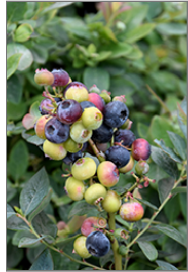
Pink Icing Blueberry fruit

This is a multi-stemmed deciduous shrub with an upright spreading habit of growth. Its relatively fine texture sets it apart from other landscape plants with less refined foliage. This is a relatively low maintenance plant, and usually looks its best without pruning, although it will tolerate pruning. It is a good choice for attracting birds to your yard. It has no significant negative characteristics.