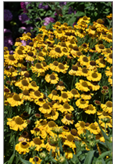
Wyndley Sneezeweed flowers