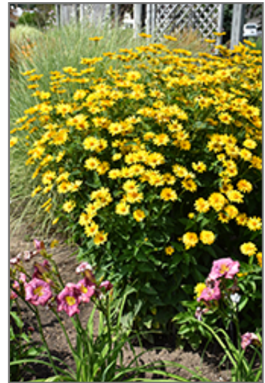
Summer Sun False Sunflower in bloom