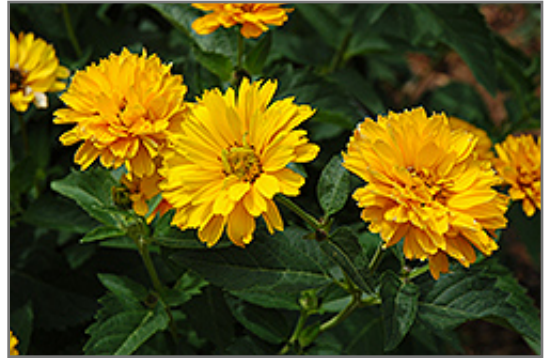
Summer Sun False Sunflower flowers

Summer Sun False Sunflower is recommended for the following landscape applications;