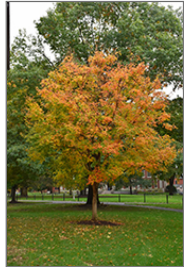
Three Flowered Maple in fall