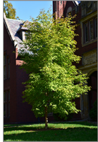
Three Flowered Maple