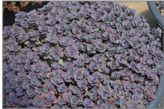
SunSparkler Blue Elf Sedoro