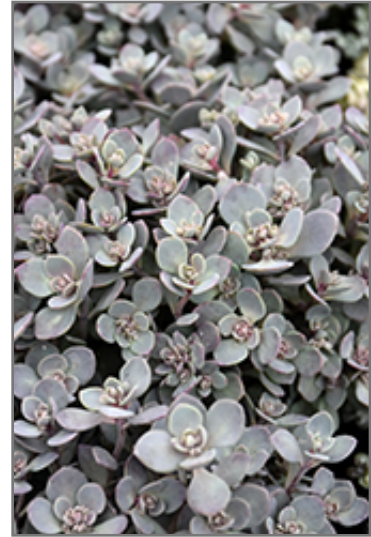
SunSparkler Blue Elf Sedoro foliage

SunSparkler Blue Elf Sedoro is a fine choice for the garden, but it is also a good selection for planting in outdoor pots and containers. Because of its spreading habit of growth, it is ideally suited for use as a 'spiller' in the 'spiller-thriller-filler' container combination; plant it near the edges where it can spill gracefully over the pot. Note that when growing plants in outdoor containers and baskets, they may require more frequent waterings than they would in the yard or garden.