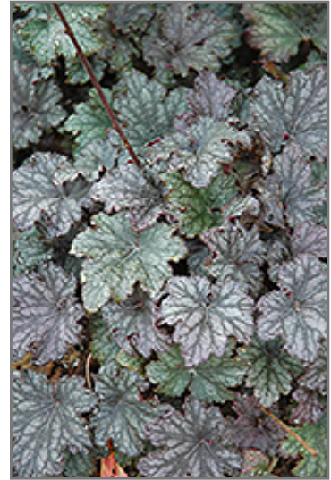
Frosted Violet Coral Bells foliage

This is a relatively low maintenance plant, and should be cut back in late fall in preparation for winter. It is a good choice for attracting hummingbirds to your yard. It has no significant negative characteristics.