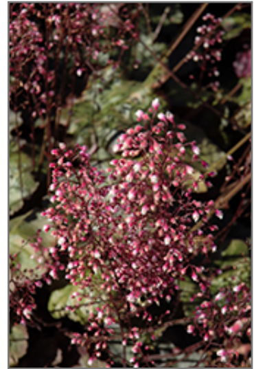
Frosted Violet Coral Bells flowers