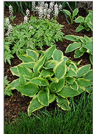
Hertha Hosta