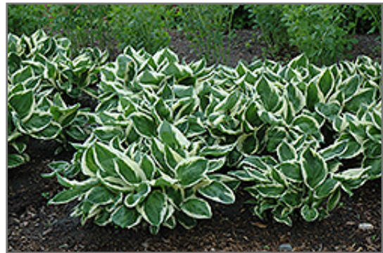
Minuteman Hosta