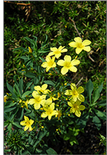
Dwarf Perennial Flax flowers