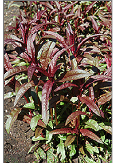
Firecracker Loosestrife foliage

* This is a 'special order' plant - contact store for details