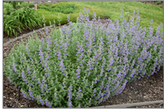
Walker's Low Catmint in bloom