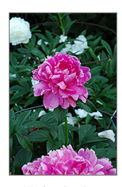
Lillian Gumm Peony flowers

Lillian Gumm Peony will grow to be about 30 inches tall at maturity, with a spread of 3 feet. When grown in masses or used as a bedding plant, individual plants should be spaced approximately 30 inches apart. The flower stalks can be weak and so it may require staking in exposed sites or excessively rich soils. It grows at a slow rate, and under ideal conditions can be expected to live for approximately 20 years. As an herbaceous perennial, this plant will usually die back to the crown each winter, and will regrow from the base each spring. Be careful not to disturb the crown in late winter when it may not be readily seen!