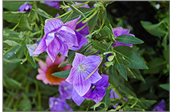
Hakone Blue Balloon Flower flowers