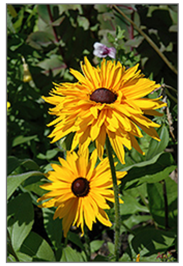
Double Gold Coneflower flowers