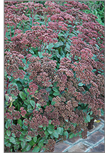
Matrona Stonecrop flowers

Matrona Stonecrop is recommended for the following landscape applications;