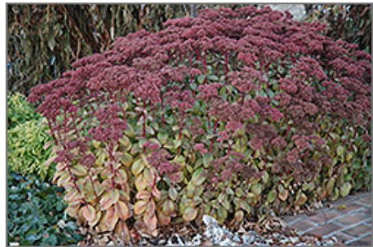
Matrona Stonecrop in fall