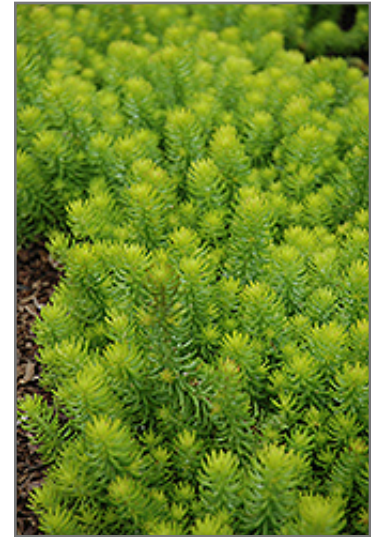
Angelina Stonecrop foliage