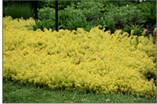
Angelina Stonecrop

This plant does best in full sun to partial shade. It prefers dry to average moisture levels with very well-drained soil, and will often die in standing water. It is considered to be drought-tolerant, and thus makes an ideal choice for a low-water garden or xeriscape application. It is not particular as to soil pH, but grows best in poor soils, and is able to handle environmental salt. It is highly tolerant of urban pollution and will even thrive in inner city environments. This is a selected variety of a species not originally from North America. It can be propagated by division; however, as a cultivated variety, be aware that it may be subject to certain restrictions or prohibitions on propagation.