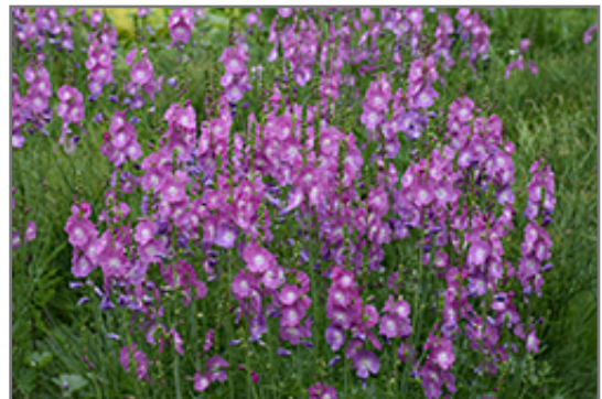
Stark's Hybrids Prairie Mallow flowers