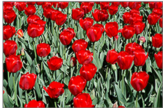
Parade Tulip flowers