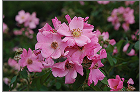
Polar Joy Rose flowers

Polar Joy Rose is recommended for the following landscape applications;