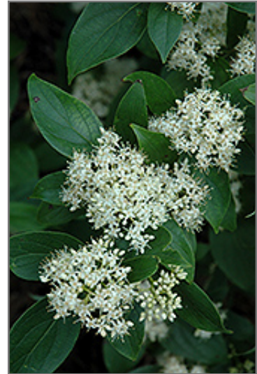
Snow Lace Dogwood flowers