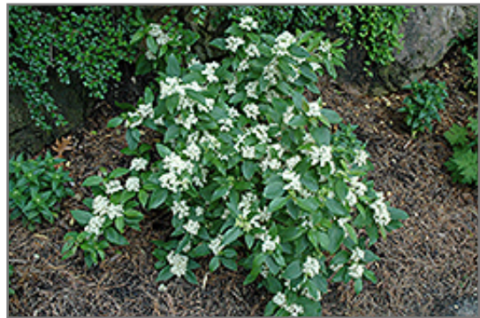
Snow Lace Dogwood in bloom